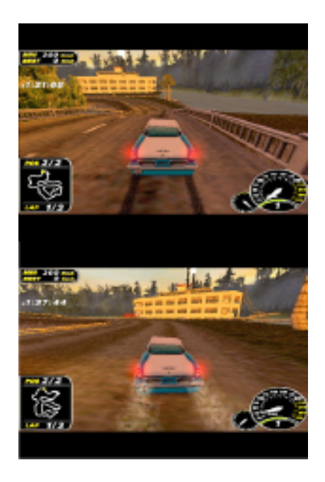
Radar #2: minimum speed: 200 mph

Start flooring it when you get on the bridge after the desert island. Stay left until you're almost off it and then keep left. Keep flooring it until you hear the sirens.